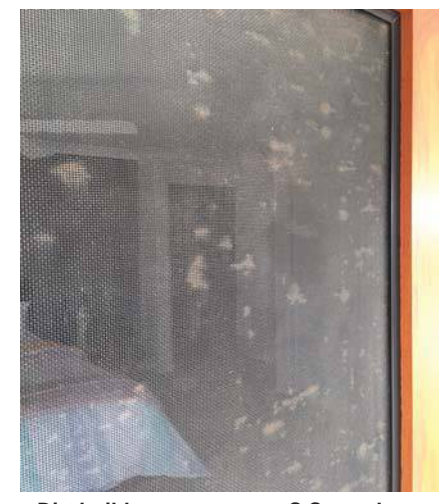
Dirt build up on a woven S.S. mesh

All metal mesh screens have a problem with electrostatic action between the mesh and airborne salts. The common solution is to regularly remove salt build up with high pressure water blasting and to seek to isolate the metal from the salts with a silicon or wax layer. There are many different forms of wax coating available commercially, ranging from Mr. Sheen to automotive wash and wax products. There are also commercially available silicone sprays sold by automotive retailers. All mesh screens trap dust and airborne particles attracted by electrostatic interaction as breeze passes through the mesh. If this impurity builds up and is not regularly removed, it will encrust the screen irreparably. There are also fungal moulds that can grow in patches on mesh caused by airborne spore. Obviously, screens in coastal locations are more vulnerable to salt attack than hinterland locations and maintenance is a bigger issue. Similarly, locations near dense vegetation have greater risk of fungal spots (which are often mistaken for rust spots) and can be eliminated by antimould and a topcoat of silicone spray. Woven screens intrinsically entrap more particles than perforated screens but the problems are the same and regular maintenance is the only prescription for long term durability.